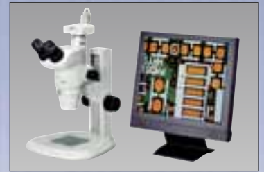
With Digital Sight series camera for microscopes