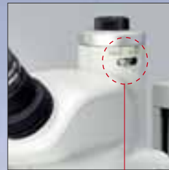
Optical path switching lever

The SMZ745T incorporates an optical path switching lever that enables easy switchover between eyepiece and camera. Nikon Digital Sight series camera can be attached.